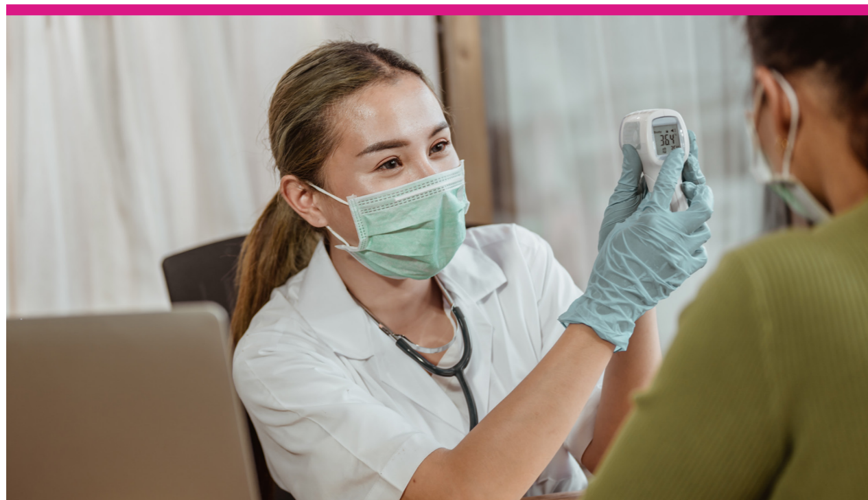
Level 2 Healthcare Support Worker

Readiness for Gateway includes confirming that the apprentice's portfolio meets the requirements of the knowledge, skills and behaviours set out within the Level 2 Healthcare Support Worker Standard. This will be confirmed at Gateway and documented on epaPRO. This notifies us that the apprentice is ready for their assessment and the EPA planning meeting will be organised.